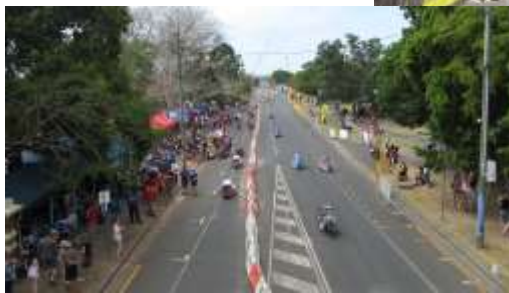
Photos from the RACQ Technology Challenge